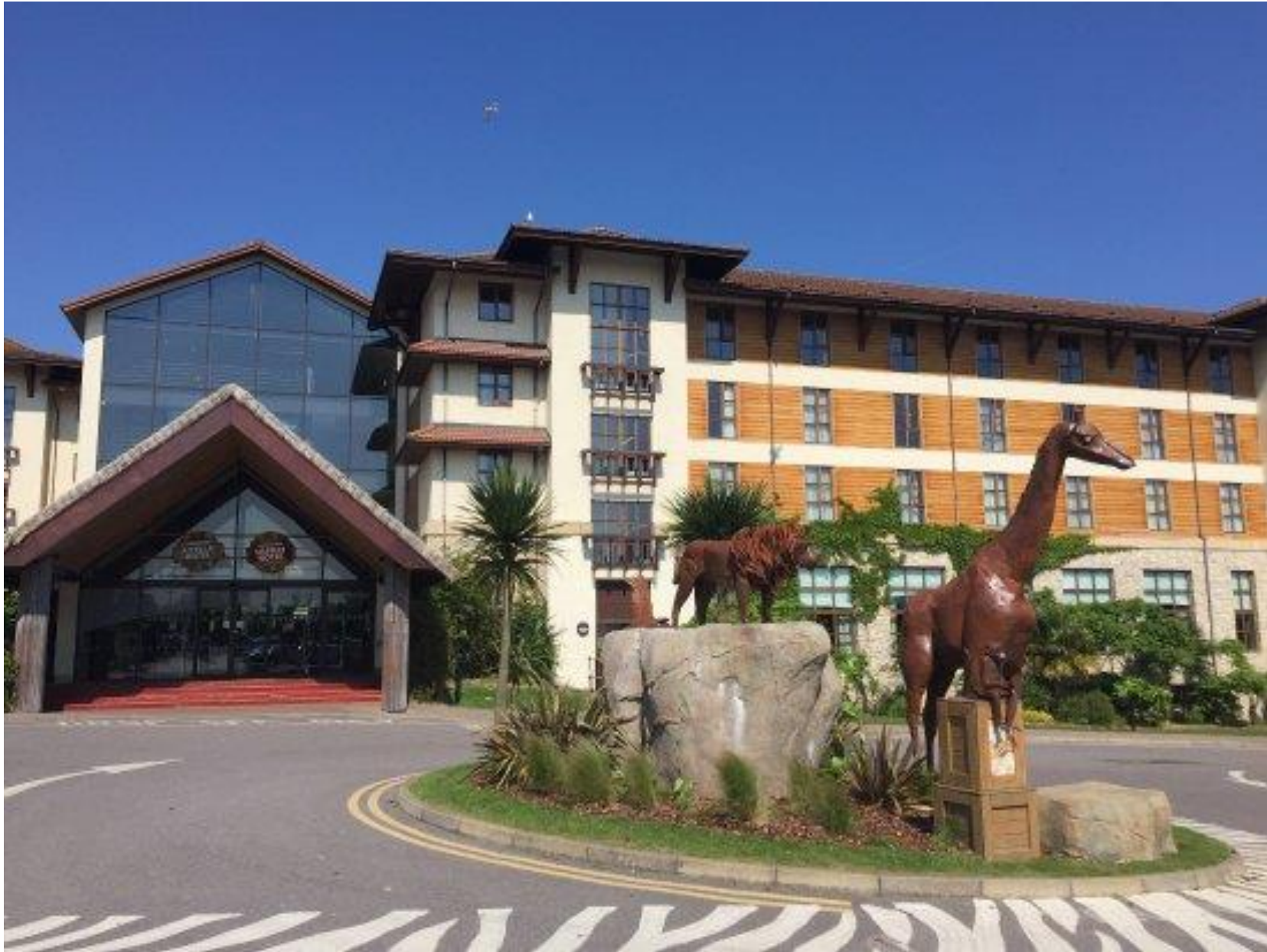
Chessington Safari Resort