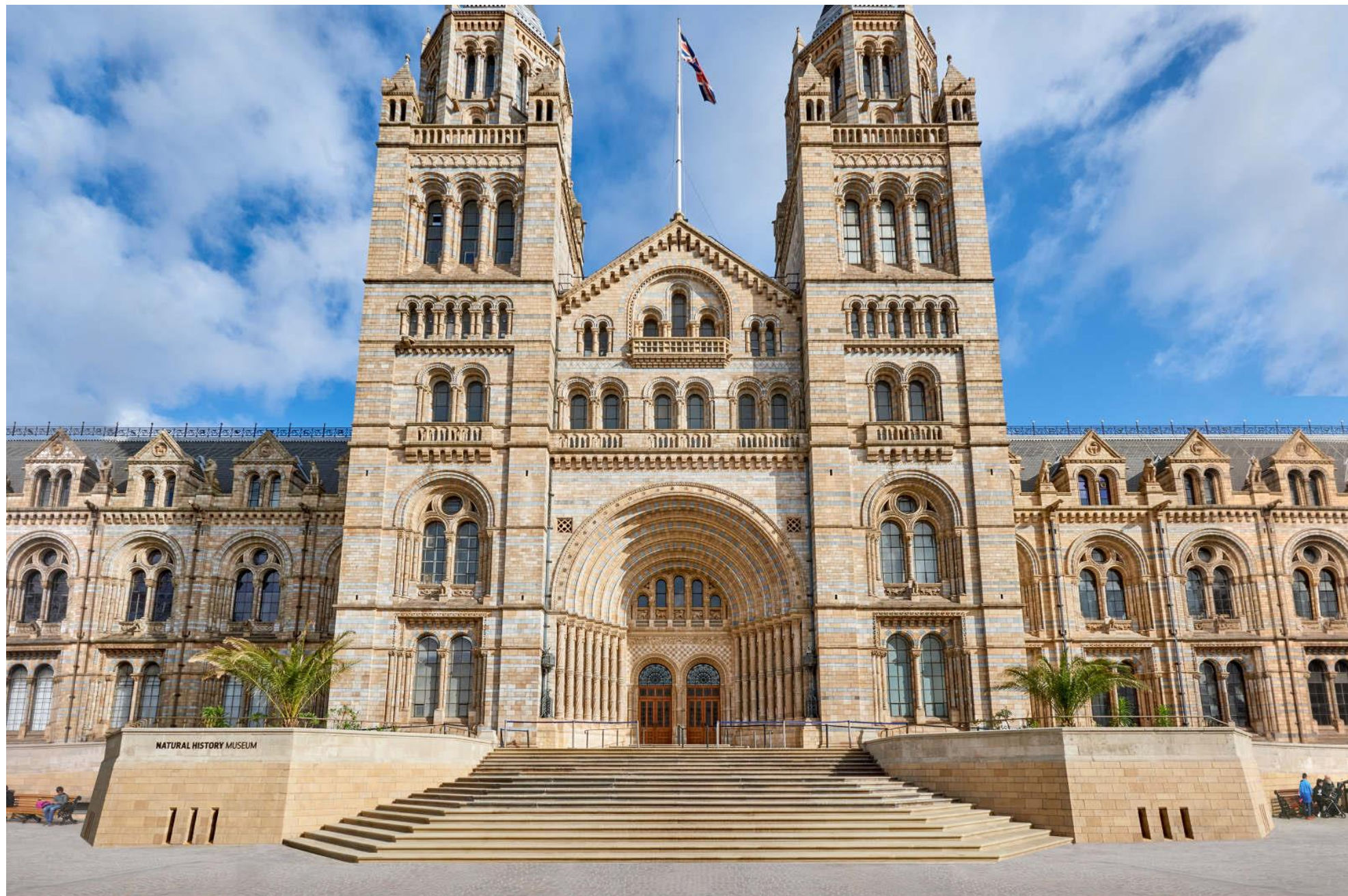
Natural History Museum